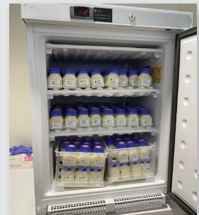
The Baby Boutique (top) offers an assortment of fun and necessary items for newborns and moms. The Milk Bank provides donated, pasteurized breastmilk for babies in need.